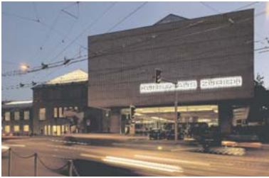
Kunsthaus Zürich