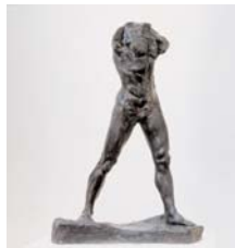
Auguste Rodin L'homme qui marche (Schreitender Mann), um 1900 Musée Bourdelle, Paris