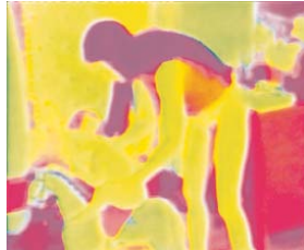
Videostill aus: Annelies Štrba Dawa, 2001