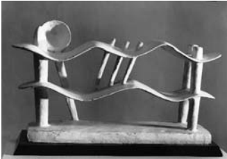
Alberto Giacometti Femme couchée qui rêve (Träumende Frau), 1929 Kunsthaus Zürich Alberto Giacometti-Stiftung