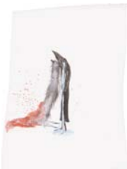
Sigga Bjorg Sigurdardottir Ohne Titel, 2006 Kunsthaus Zürich © Sigga Bjorg Sigurdardottir