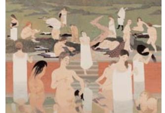
Félix Vallotton Das Bad am Sommerabend, 1892 Kunsthaus Zürich Leihgabe der Gottfried Keller-Stiftung