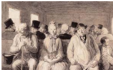
Honoré Daumier In der dritten Klasse, um 1864 Schweizer Privatbesitz