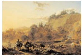
Nicolaes Berchem Italienische Landschaft, Felspartie und Hirte mit Vieh, um 1653/55 Frans Hals Museum, Haarlem