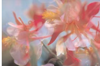
Peter Fischli / David Weiss Ohne Titel (Blume), 1997