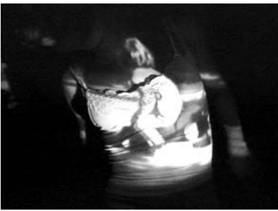
Still aus: Zilla Leutenegger Afrika, 1999 Kunsthaus Zürich, Video-Sammlung © Zilla Leutenegger