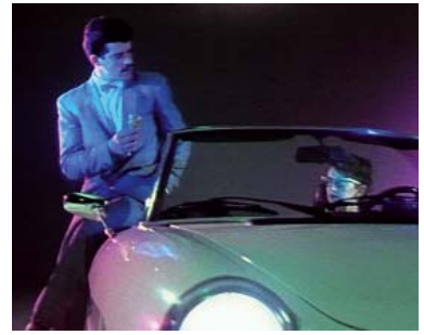
Still aus: Yello I love you, 1983 Kunsthaus Zürich, Video-Sammlung