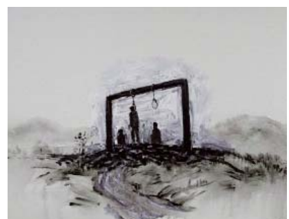
Still aus: Qiu Anxiong Minguo Landscape, 2006/07 Kunsthaus Zürich, Video-Sammlung © Qiu Anxiong