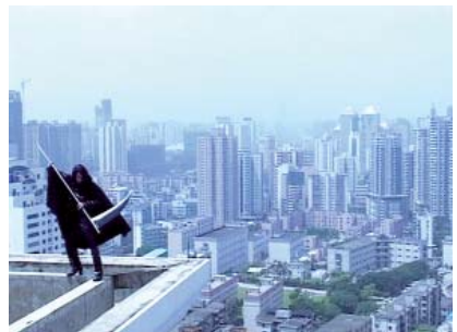
Still aus: Cao Fei Cosplayers, 2004 Kunsthaus Zürich, Video-Sammlung © Cao Fei