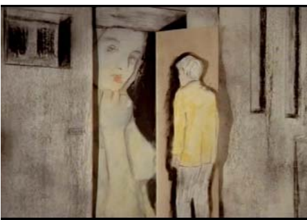
Still aus: Jochen Kuhn Neulich 5, 2004 Kunsthaus Zürich, Video-Sammlung © Jochen Kuhn