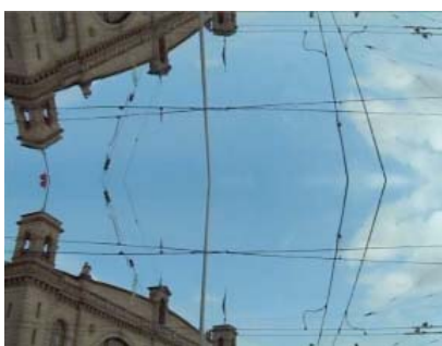
Still aus: Bessie Nager roadmovie zürich, 2006 Kunsthaus Zürich, Video-Sammlung © Bessie Nager