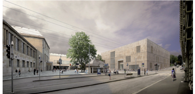
First draft competition rendering of Kunsthaus Zurich extension by winner David Chipperfield Architects / ©Imaging Atelier.